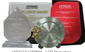
HITACHI [JAPAN] - LCD Projectors Outstanding Sales 2002 / 03 / 06 Regional Distributor - Maxell 2021