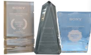
SONY [Singapore] - LCD Projectors Authorised Dealer Of Professional Solution 2012 Preferred Partner 2018/2019 Outstanding Performance 2015