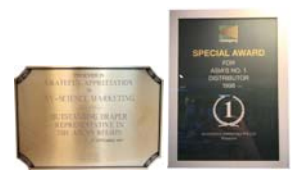
LIESEGANG [GERMANY] - OHP 1997,1998 - Asia No.1 Distributor DRAPER [USA] - Projector Screens Outstanding Representative in Asia Region 1997