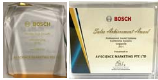
BOSCH [SINGAPORE] - Pro-Audio Double Digit Growth 2016 - Sales Achievement Award 2021