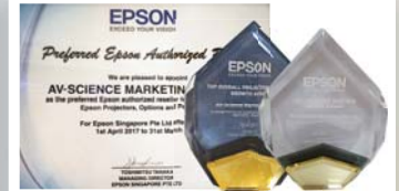
EPSON [SINGAPORE] -- LCD Projectors Valuable Contribution and Support 2010 -Preferred Authorized Reseller 2017 Outstanding Performance 2017-19