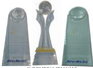
AVERMEDIA [TAIWAN] - Doc Camera 2006 - 2012 Best Partner, Singapore