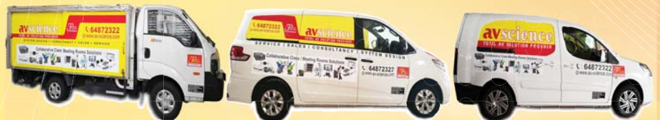
(Fleet of more than 10 vans)

We continuously source for new technology and work collaboratively with our great business partners (local and overseas) and to serve our customers with cost and time saving solutions