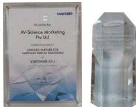
SAMSUNG [ASIA] - LFD/Signage Outstanding Performance 2010/11 - Certified Partner 2015 -2016