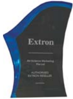
EXTRON [USA] - Integrated Control System Authorised Reseller