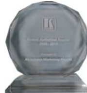
KRAMER - Integrated Control System Authorised Reseller