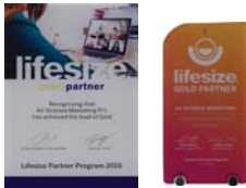
LIFESIZE -Video Conferencing Solution Expert Partner in Lifesize Product Services in Singapore. -Gold Partner -2015 - 2019