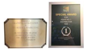
LIESEGANG [GERMANY] - OHP 1997,1998 - Asia No.1 Distributor DRAPER [USA] - Projector Screens Outstanding Representative in Asia Region 1997