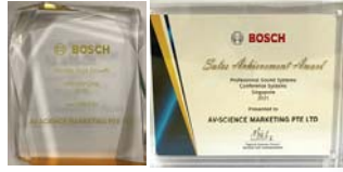
BOSCH [SINGAPORE] - Pro-Audio Double Digit Growth 2016 - Sales Achievement Award 2021