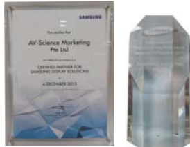
SAMSUNG [ASIA] - LFD/Signage Outstanding Performance 2010/11 - Certified Partner 2015 -2016