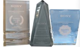
SONY [Singapore] - LCD Projectors Authorised Dealer Of Professional Solution 2012 Preferred Partner 2018/2019 Outstanding Performance 2015