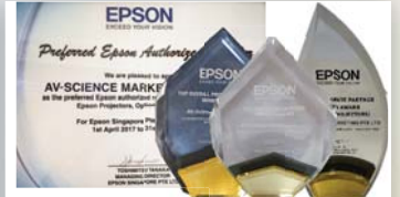
EPSON [SINGAPORE] -- LCD Projectors Valuable Contribution and Support 2010 -Preferred Authorized Reseller 2017 -Outstanding Performance 2017-19 -Top Corporate Partner Growth Award (Overall Projectors) 2021