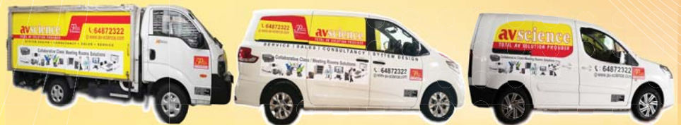
(Fleet of more than 10 vans)

We continuously source for new technology and work collaboratively with our great business partners (local and overseas) and to serve our customers with cost and time saving solutions