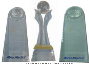
AVERMEDIA [TAIWAN] - Doc Camera 2006 - 2012 Best Partner, Singapore