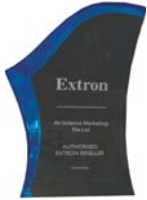
EXTRON [USA] - Integrated Control System Authorised Reseller